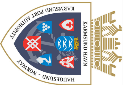
CHART DETAILS KARMSUND HARBOUR HUSØY BULK TERMINAL Installations, lengths and heights of quays Heights above chart datum NOT FOR NAVIGATIONAL USE ! REV.NR. 04 - 30.04.2019